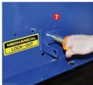
Safety by design with four point lift conveyor lockouts