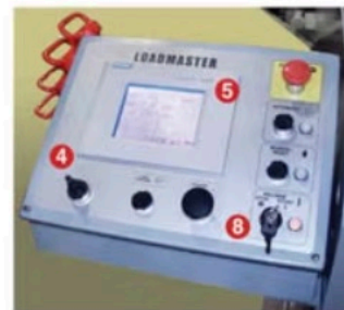
Operator-friendly controls for easy set-up and operation