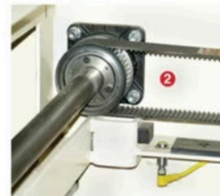
Low maintenance stripper drive with non-lube timing belt